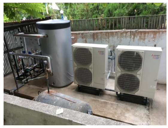
The heat pump (dining room, the Polytechnic-2 Recreational Camp, Ukraine)