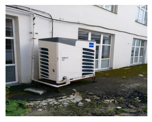
Heat pump with recuperator (main building, Lviv)