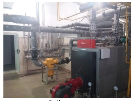
Boiler room (educational building No. 21, Lviv)