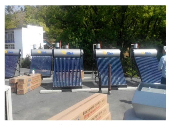
Solar helio system (dining room, the Polytechnic-2 Recreational Camp, Ukraine)