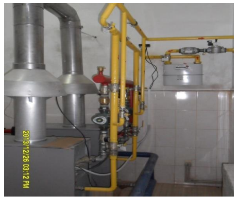
Boiler room (educational building No. 33, Lviv)

The assembly hall of the main university building and the reading room of the student library are heated and cooled by heat pumps with heat recovery units. Hot water is prepared in the educational and recreational camp "Polytechnic-3" and on the 3rd floor of the student catering facility using air-to-water heat pumps. The old air conditioners are replaced with new inverter air conditioners as the old ones fail. Some examples of energy-efficient appliances are given below.