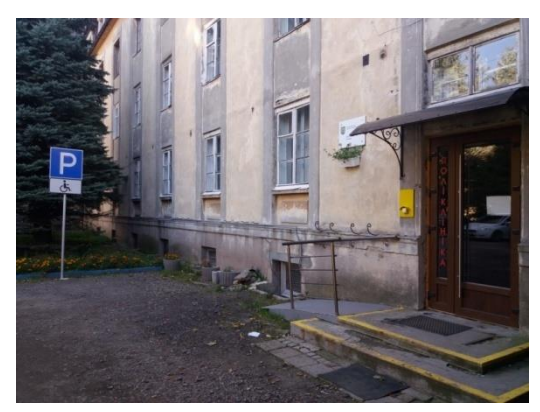
Entrance to the university's hospital and clinic

There are first aid stations in the university's academic buildings and dormitories. A polyclinic monitors the health of students and teachers. Following the requirements of occupational health and safety standards, teachers and students undergo annual medical examinations. The 10th City Hospital is used to treat students and teachers of the University. The polyclinic and hospital are located in a building owned by the university at 14 Boy-Zhelenskyi Street.