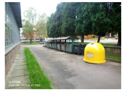
Garbage container area near the 13th building