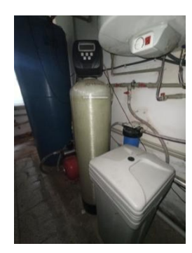
The water purification system of building No. 4 of the Polytechnic-2 Recreational Camp

The university has a permit to discharge wastewater into the municipal sewerage system of Lviv. Wastewater quality control is carried out 4 times a year according to the contract. According to the results of the wastewater quality studies, the content of harmful substances has not exceeded the permissible standards over the past five years.