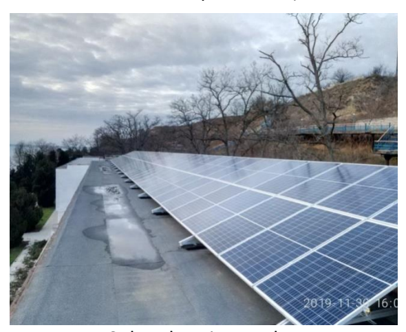
Solar electric panels (building No. 10, the Polytechnic-2 Recreational Camp, Ukraine)