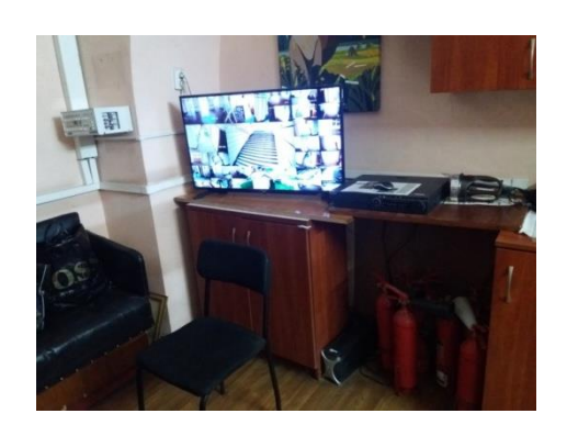
Security post of the main building (video surveillance, fire extinguishers, fire and security alarm panel)