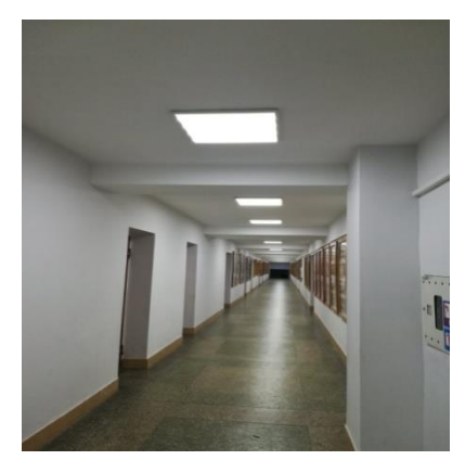
LED lighting (educational building No. 4, Lviv)