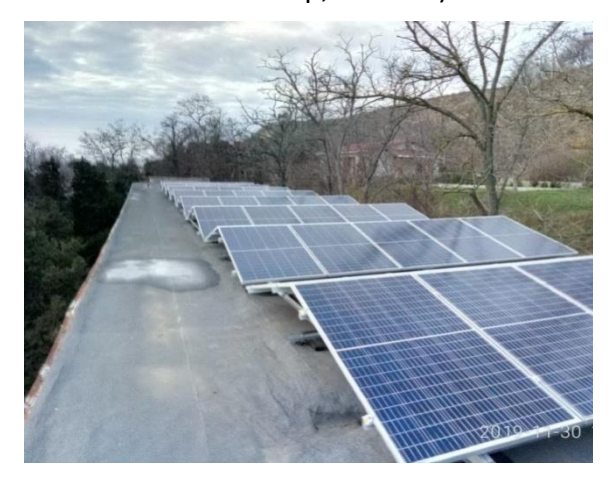
Solar electric panels (building No. 9, the Polytechnic-2 Recreational Camp, Ukraine)

In addition, a laboratory installation of a 6.4 kW solar power plant was installed in the educational building No. 5. This power plant is used for student training and research; it is directly connected to the building's power grid and partially provides its power supply.