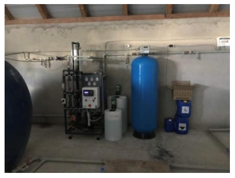
The water purification system of the Polytechnic-3 Recreational Camp