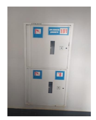
The fire shield of the 23rd building

The university's academic buildings and dormitories are equipped with an internal fire water supply system with fire extinguishing pumps, fire and burglar alarms, powder fire extinguishing systems, and internal and external video surveillance systems. All university facilities have fire extinguishers.