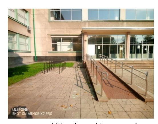
Ramp and bicycle parking near the educational building №1 at 2/4 Karpinskoho Street

Places near the university are very well served by public transport.