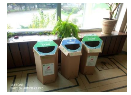
Paper containers for waste sorting

Lviv Polytechnic National University has a waste recycling program. The university is also a member of the Clean City program. The university sorts waste into glass, plastic, paper, mixed waste, and batteries. At present, the Rector's order created the PolitechEko working group to organize waste sorting. The working group's functions include implementing a training program with students and staff on the correct waste sorting. The materials of the working group are available on the university website at <a href="https://lpnu.ua/politecheko">https://lpnu.ua/politecheko</a> and on Facebook here: <a href="https://www.facebook.com/groups/2215182245475435">https://www.facebook.com/groups/2215182245475435</a> The university's academic buildings and dormitories have special containers for waste sorting, and there are also container sites for outdoor waste collection. In addition to paper, glass, plastic, and mixed waste, special boxes for collecting used batteries are installed in academic buildings and dormitories.