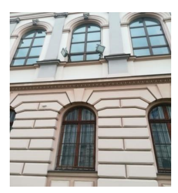
LED lighting (main building, Lviv)

The heat carrier is distributed in the buildings of academic buildings using modern individual heat stations with weather control of the heat carrier temperature. Currently, 27 individual heat points are already operating at the university. Individual heat points of dormitories and academic buildings are dispatched using a remote monitoring and control system that allows remote reading of heat meters, creating archives of heat consumption, and changing the settings of individual heat points. Data is transferred between the individual heating stations and the central computer via GPRS communication.