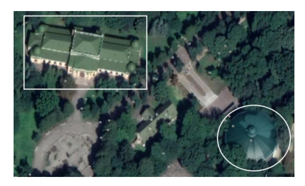
Educational buildings No. 21, 22

The sports complex is located in Stryiskyi Park in buildings 21 and 22 at 14 U. Samchuk Street. It has a swimming pool and gymnasiums for basketball, volleyball, handball, football and futsal, tennis, chess, athletics, kettlebell lifting, judo-sambo, freestyle and Greco-Roman wrestling, sports aerobics, boxing, sports tourism, swimming and other sports. The most demanding athletes will be able to satisfy the following interest groups: artistic gymnastics, dance aerobics, hand-to-hand combat, shaping, karate, kickboxing, badminton, tennis, and other sports.