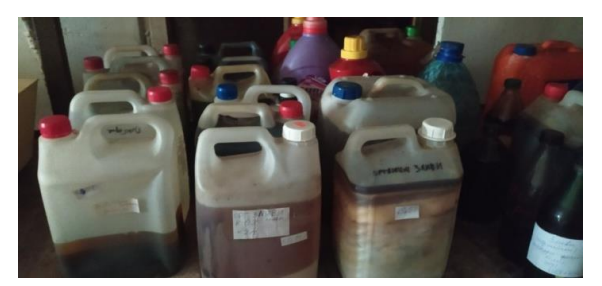
Tanks for the disposal of toxic waste

The university also regularly collects and recycles ferrous and non-ferrous scrap metal.