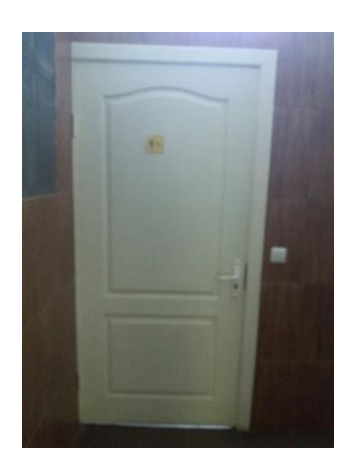
Bathroom for people with disabilities in the 1st building

To implement the right to higher education of persons with disabilities and chronic diseases the unit "No Limits" Services of Accessibility to Learning Opportunities (hereinafter – "No Limits" Accessibility Services) is operating at Lviv Polytechnic National University, within International "Integration" Centre for Professional Partnerships (hereinafter – International "Integration" Centre) in accordance with Order No. 43-12 of March 14, 2017, "On the Establishment of "No Limits" Services of Accessibility to Learning Opportunities". https://test-new.lpnu.ua/en/no-limits