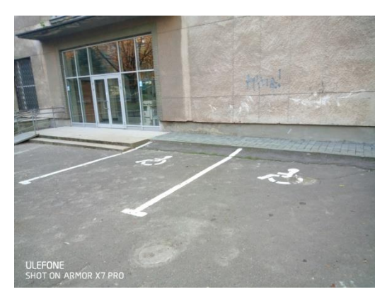
Parking spaces for people with disabilities near the educational building №1 at 2/4 Karpinskoho Street