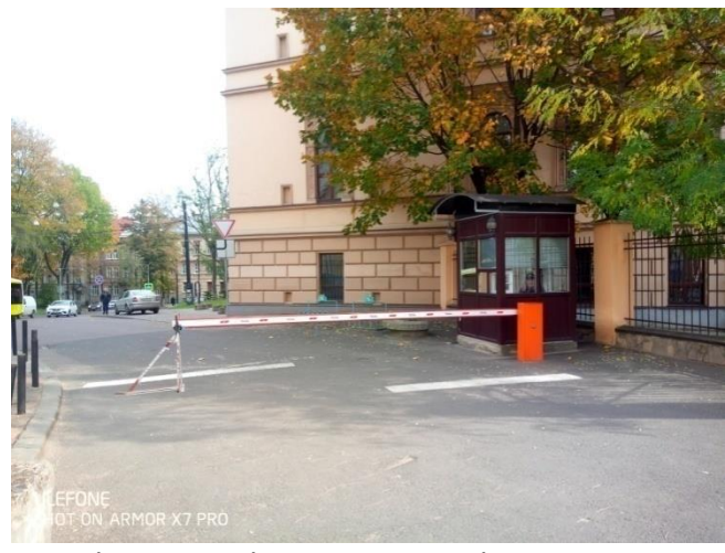
A barrier at the entrance to the university

The university does not own any shuttle buses. There may be shuttle buses on the territory of the university that serve conferences and other group trips for university employees. The number of shuttle buses that serve conferences and other group trips of university employees is 1-2 buses every 5-10 days, i.e. the load per day is 0.25 buses/day. The average number of passengers in each shuttle bus is 60 people.