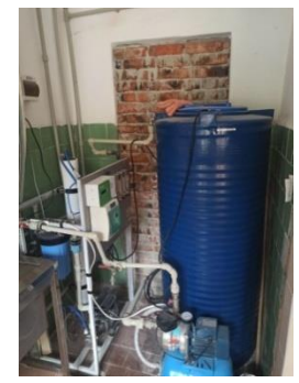
The water purification system of building No. 1 of the Polytechnic-2 Recreational Camp