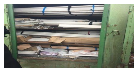
Warehouse for the disposal of mercury lamps