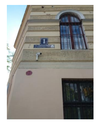
External video surveillance of the 3rd building