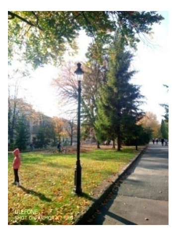
Illumination of the territory of the main building at 12 S. Bandera Street