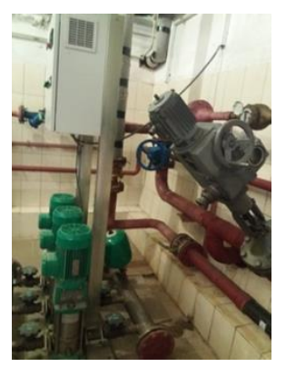
Fire and household pumping station and electrically operated gate valve of the 21st building