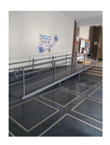
Ramp in the premises of the 1st building

Most of the university's academic buildings and dormitories are partially accessible and operated. They are equipped with means of unimpeded access to buildings for people with limited mobility (ramps, elevators, bathrooms).